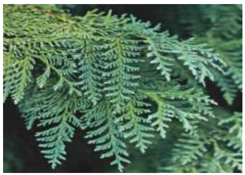
Figure 1: Plant of Thuja Koraiensis

One of the coniferous or evergreen shrubs in the genus Thuja, which is a constituent of the evergreen family, is known by the widespread name "tree of life" (William and Jackson, 1967). Native Americans and early European physicians used thuja leaves, which are rich in vitamin C, to treat scurvy. The leaves are used to treat rheumatism. The plant commonly used to cure warts, the genitalia, and the human papillomavirus (HPV) is referred to as a curiosity. 3 to 10 metres in height. The leaves grow in a flat form with huge, 2 to 4 mm (or up to 15 mm) long leaves that are dark green on top and have dark white waxy stripes on the reverse. Oval, yellow-green, ripe, reddishbrown, and measuring 7-11 mm long by 4-5 mm wide are the cones.<sup>[5]</sup>