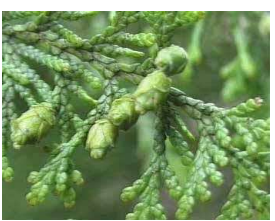
Figure 5: Plant of Thuja Sutchuenensis

medium-sized. rising up at maybe 20 m tall, yet there are no trees. are currently known to begin at this size.the trees buildings sprinkled with leaves that resemble scales 1.5–4 mm long with a tight white border and a green top. Stomatal clusters beneath Cones are round. oval, naturally shaded green, 5-8 mm 3–4.2 mm in length and broad (opening to 7 mm wide), with scales ranging from 8 to 10.<sup>[8]</sup>