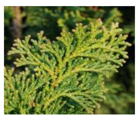
Figure 4: Plant of Thuja Standishi

Japanese thuja, also known as nezuko or kurobe, is a species of thuja. On the islands of Honshu and Shikoku in southern Japan, it can be found close by. It is a medium-sized tree that stands 20-35 metres tall and has a trunk that may reach 1 metre in height. The foliage is arranged in level showers and has narrow, white stomatal clusters beneath scale-like, 2-4 mm long, matte green leaves on top. The cones are round, vellowgreen with a reddish-heart center, 6-12 mm long, 4-5 mm wide (expanding to 8 mm wide), and covered in 6-10 scales. It is a prominent lumber tree in Japan, valued for its sturdy, water-resistant, seductively perfumed wood. There is some evidence that focuses on this. biological diversity T standishii. [6]